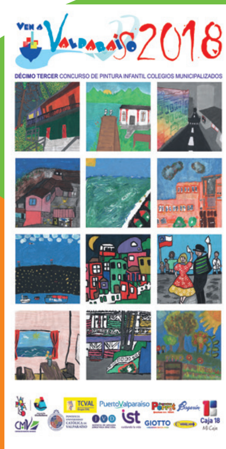
CARDS AND CALENDARS BASED ON THE CHILDREN'S DRAWINGS.