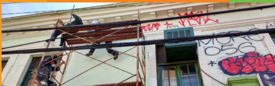
CLOSE-UP OF EXECUTED WORK.